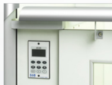
Control and alarm panel for fan fail and sash high warning