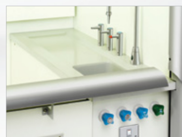
Bespoke worktop, sink and servicing arrangements