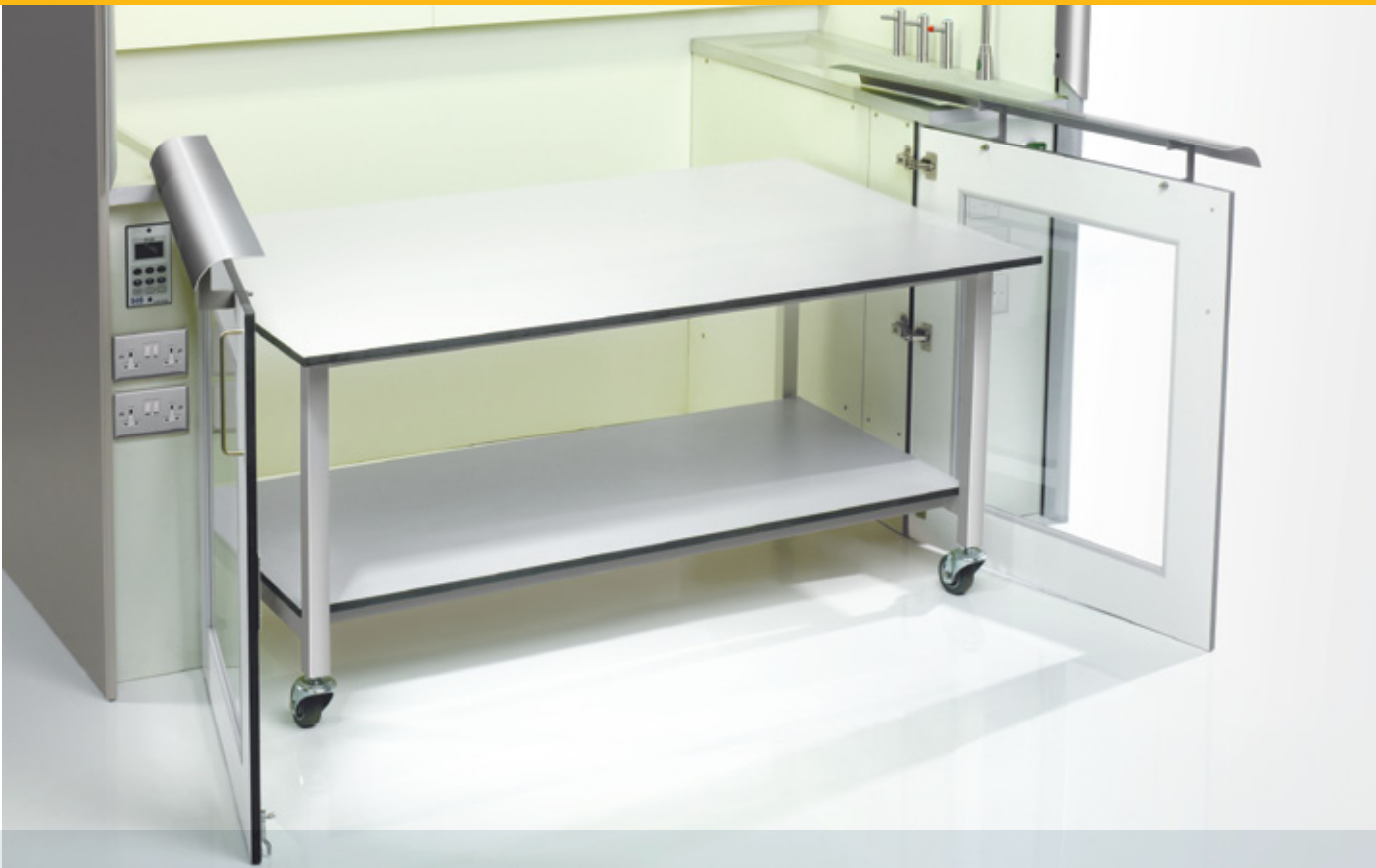
Purpose built pull out trolleys, high level and low level removable worktops