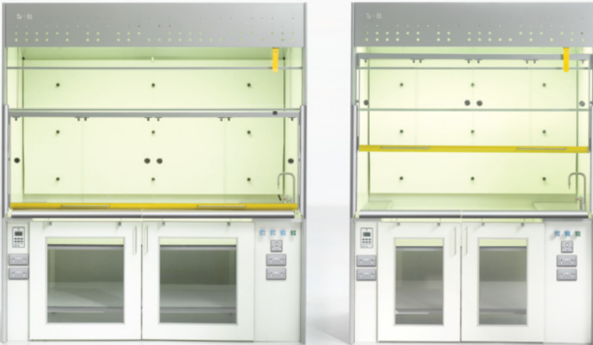
Supplied in standard and bespoke widths, with or without low level doors