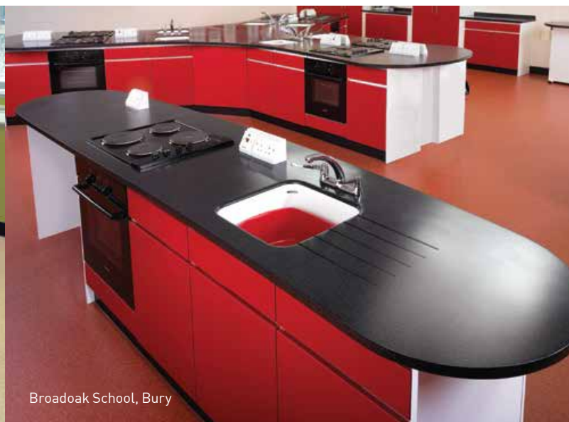
Broadoak School, Bury