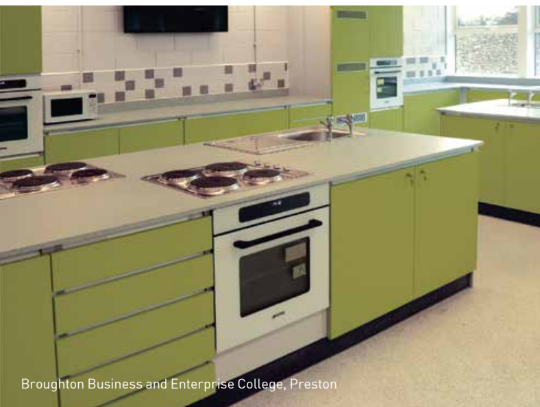
Broughton Business and Enterprise College, Preston