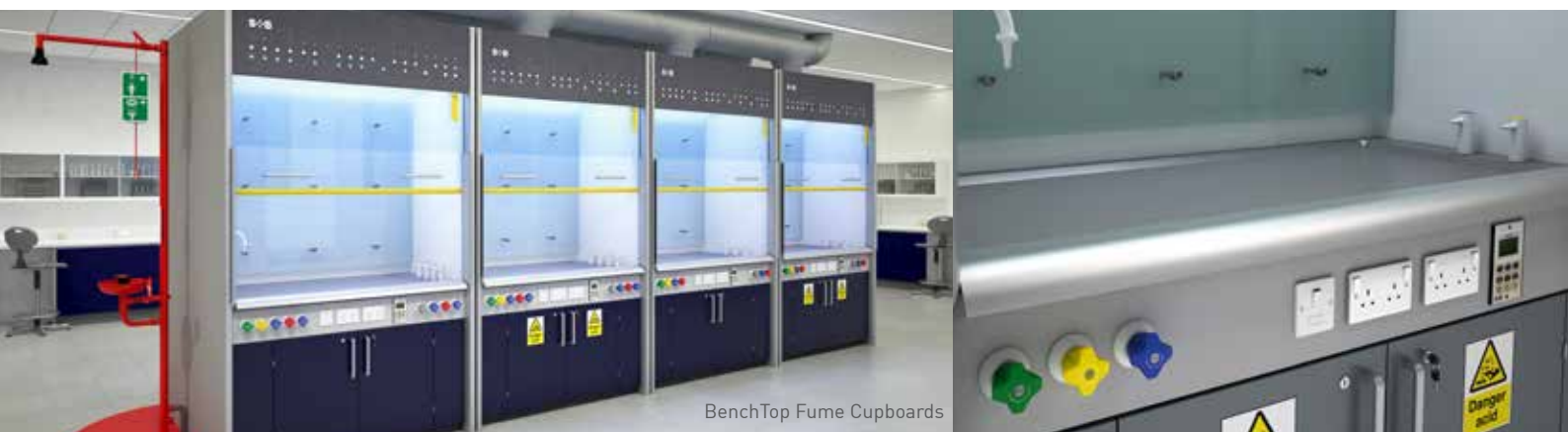
BenchTop Fume Cupboards

Note - A fume cupboard is not a total containment cabinet and should never be used for any application which requires guaranteed 100% containment at all times.