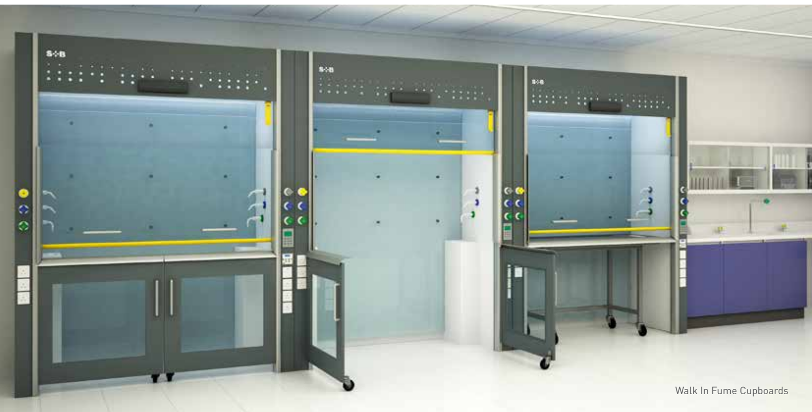
Walk In Fume Cupboards

For special applications where there are very high heat loads, radio-active work, Kjeldahl work and processes involving chemicals like hydrofluoric acid, a range of suitable liners are available and include Trespa, Cast Epoxy, Toughened Glass, 316 grade SS and polypropylene.