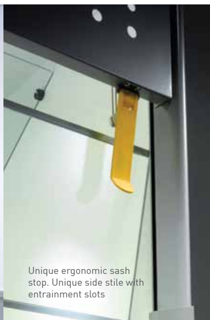
Unique ergonomic sash stop. Unique side stile with entrainment slots