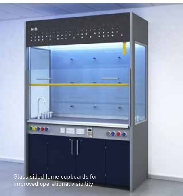
Glass sided fume cupboards for improved operational visibility

Food – Food Research Association, Hazlewood Foods, Princess Drinks, Danisco, Cerestar, Nestle, Proctor and Gamble, Boddingtons, RHM.