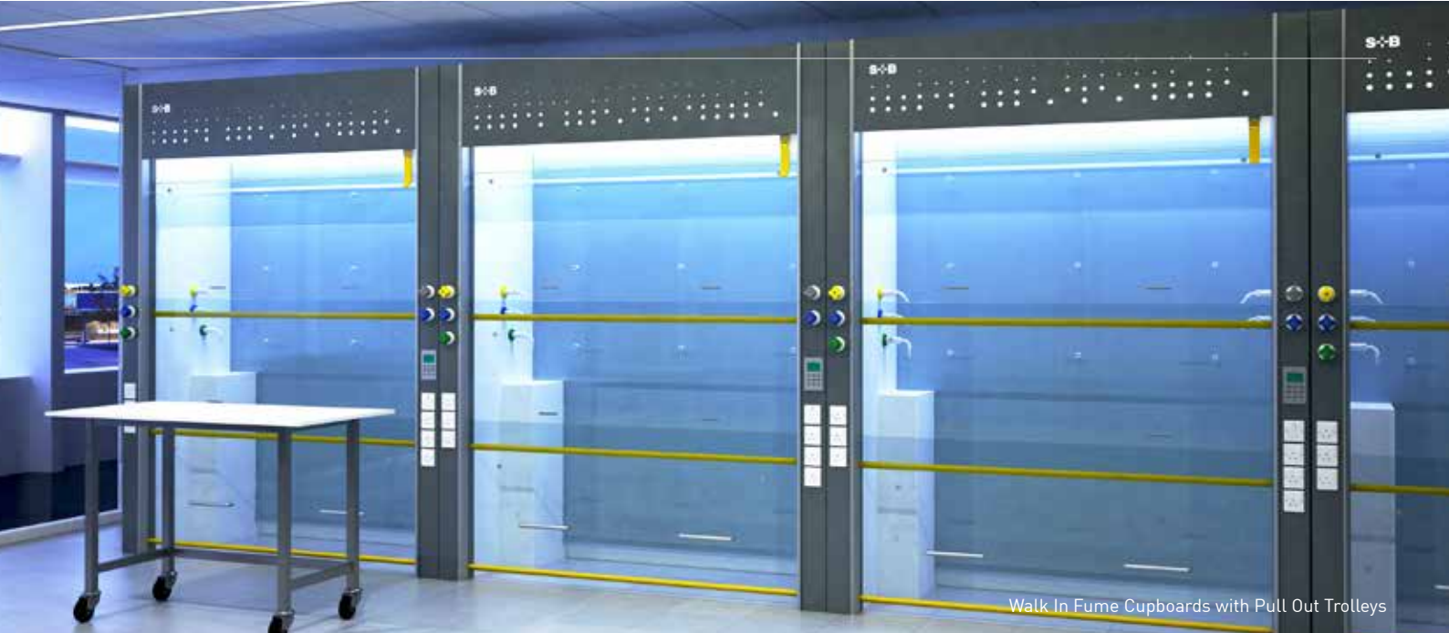
Walk In Fume Cupboards with Pull Out Trolleys