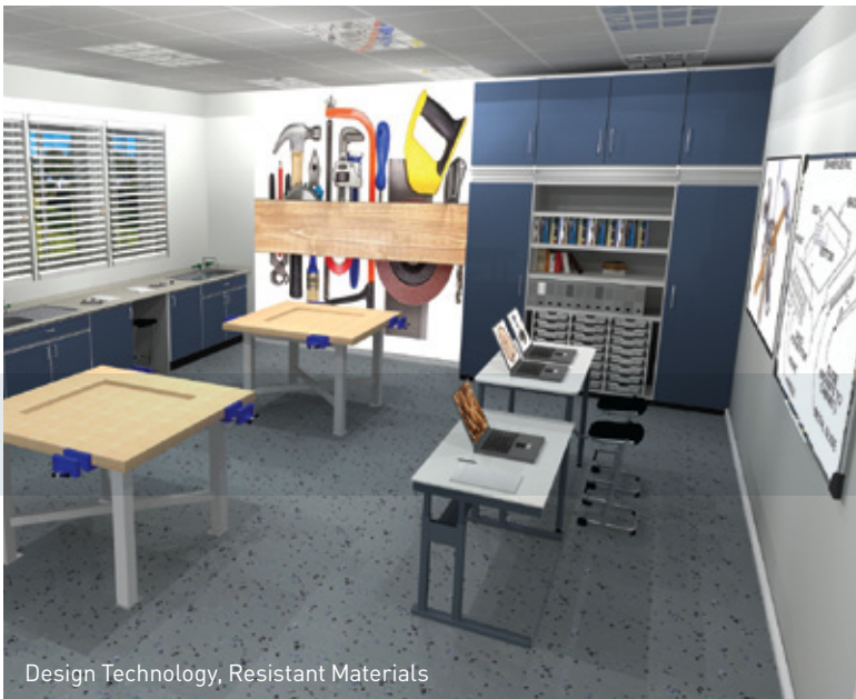
Design Technology, Resistant Materials

“Inclusion is about much more than the type of school that children attend: it is about the quality of their experience; how they are helped to learn, achieve and participate fully in the life of the school” SEN Strategy