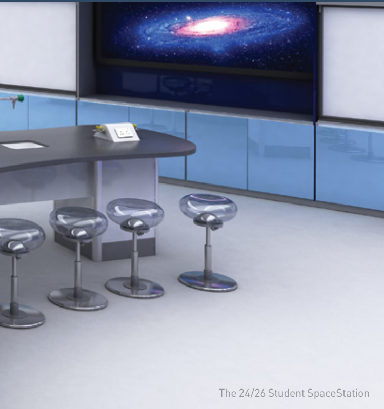
The 24/26 Student SpaceStation

SpaceStation provides safe, comfortable seating positions for students and renders perimeter benching spare capacity which can then be dedicated to storage because it is not needed for practical work. The generous work surface space per student, excellent circulation space and fully serviced worktops are equally well suited to dedicated biology, chemistry, physics and accordingly for integrated science.