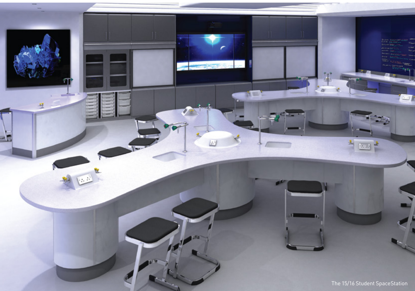
The 15/16 Student SpaceStation

S+B has been at the forefront in researching and developing new, innovative and compelling specialist science furniture systems for several decades. The introduction of SpaceStation is the latest affirmation of our ongoing commitment to providing exciting and inspirational science learning spaces.