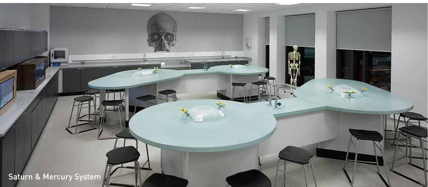
Saturn & Mercury System