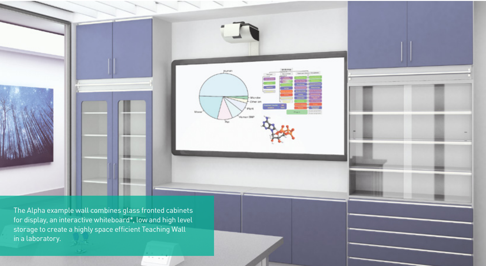
The Alpha example wall combines glass fronted cabinets for display, an interactive whiteboard*, low and high level storage to create a highly space efficient Teaching Wall in a laboratory.