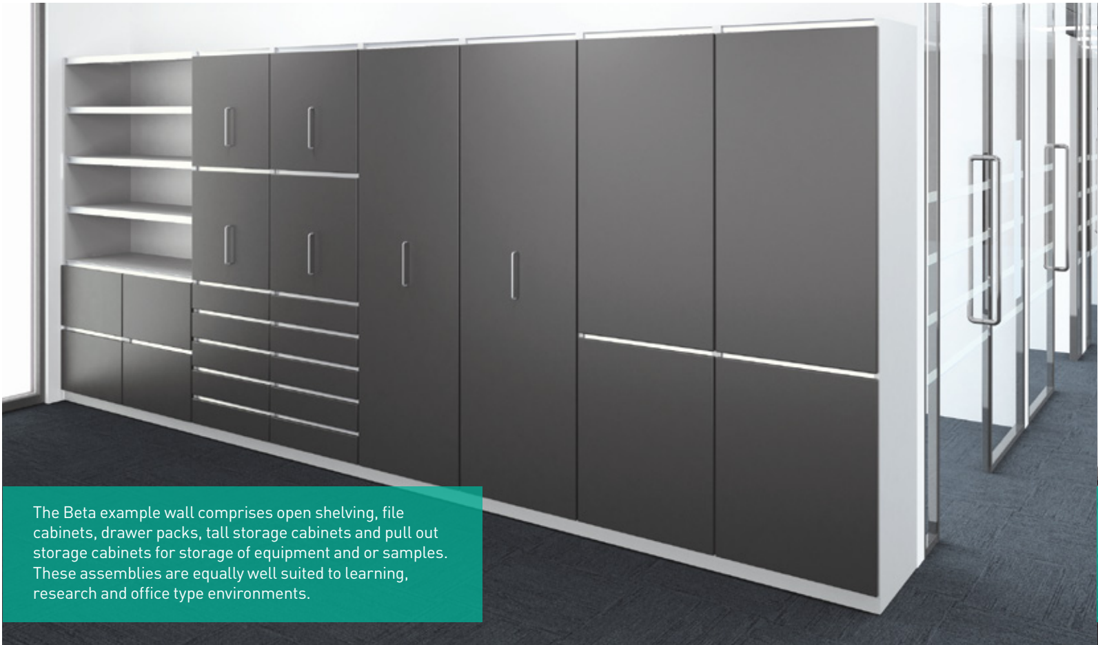
The Beta example wall comprises open shelving, file cabinets, drawer packs, tall storage cabinets and pull out storage cabinets for storage of equipment and or samples. These assemblies are equally well suited to learning, research and office type environments.

To illustrate our new range of storage furniture our design team have compiled 5 example renderings to show some possible uses. The Spacesaver assembly has endless configurations that would be suitable as a teaching wall with whiteboards for school and university or as a highly space efficient resource base for any research or working environment.