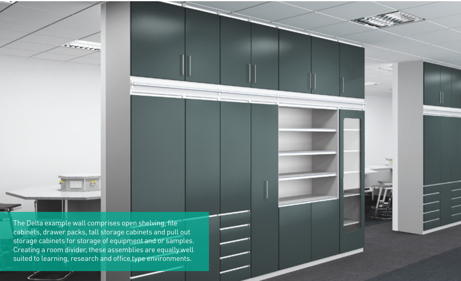
The Delta example wall comprises open shelving, file cabinets, drawer packs, tall storage cabinets and pull out storage cabinets for storage of equipment and or samples. Creating a room divider, these assemblies are equally well suited to learning, research and office type environments.