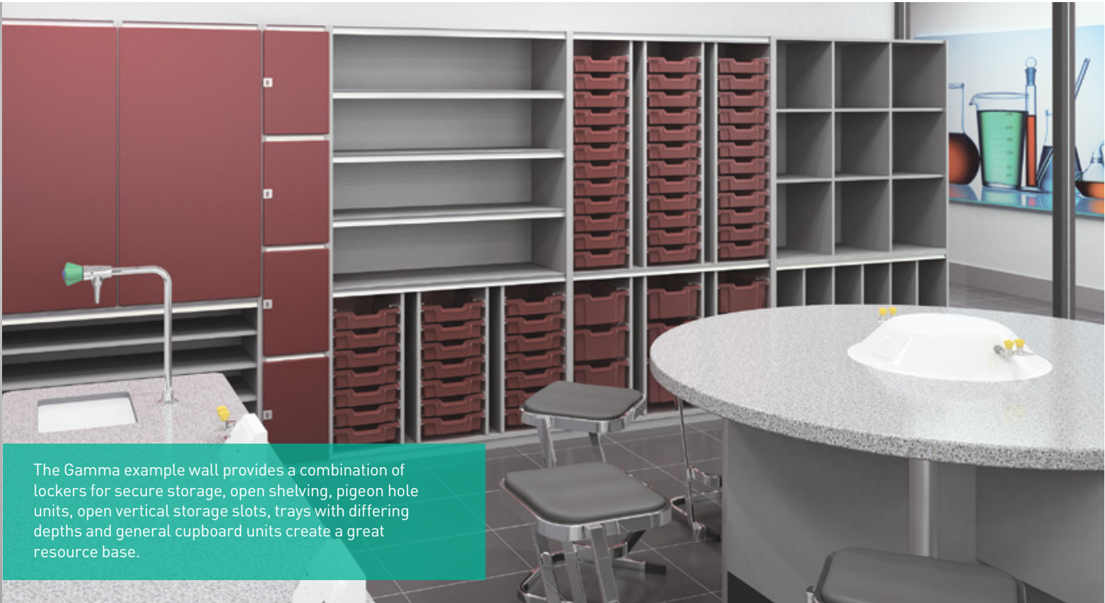
The Gamma example wall provides a combination of lockers for secure storage, open shelving, pigeon hole units, open vertical storage slots, trays with differing depths and general cupboard units create a great resource base.